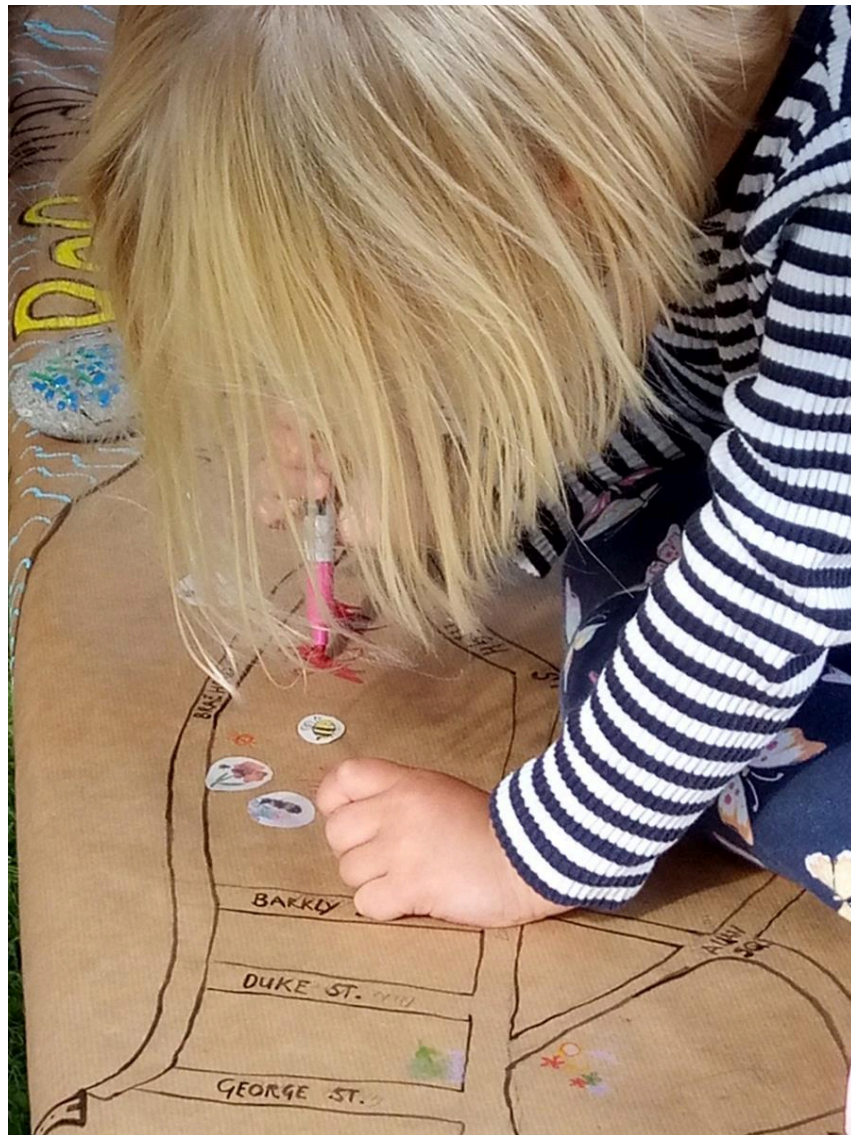
Drawing on the Humble Bee Map

The map and trail will be on display during September, both inside and outside the museum. You are invited to come along and view the exhibition and add your own bee drawings, thoughts and stories. Perhaps you are growing flowers for supporting bees or making (and eating!) honey, even reviving tired bees when you come across them – let us know! This project was enabled with funding from Museums Galleries Scotland and Year of Stories 2022.